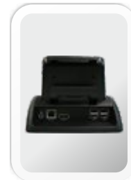
Desktop Charging Cradle